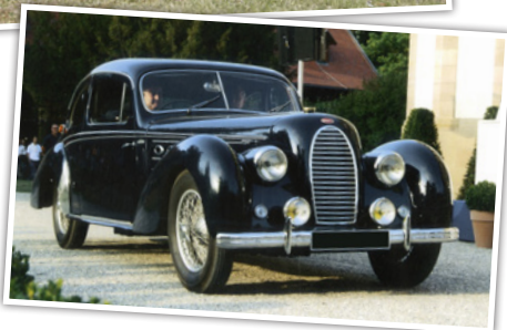
BUGATTI 101 Coach - Guilloché (1951)