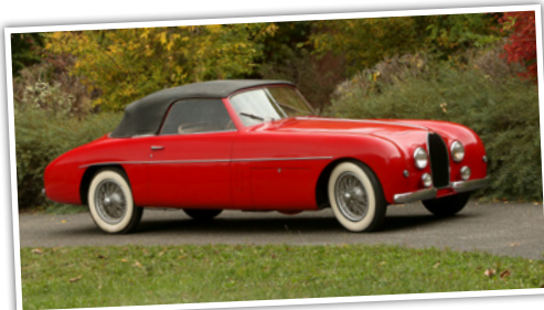
BUGATTI 101 Cabriolet - Gangloff (1952)