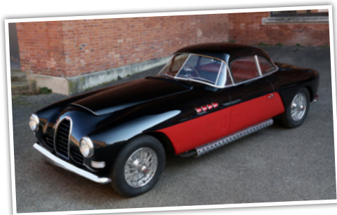
BUGATTI 101 Coupé - Antem (1952)