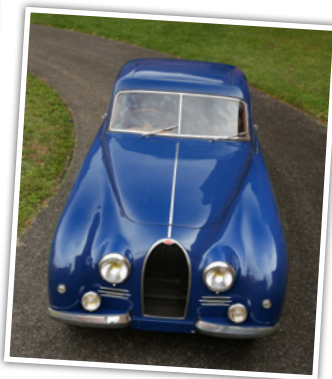
BUGATTI 101 Coach - Gangloff (1951)